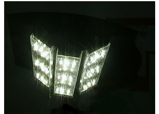
BINAY's new 'Eagle-Eye' LED Street Light (Adjustable Asymmetric Beam design)

This design has an arrangement for adjusting the beam pattern, which allows it to cover locations with different pole-to-pole distances while providing even illumination coverage