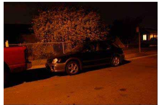
THE VISUAL PERCEPTION PROBLEM: A street illuminated with HPSV lighting