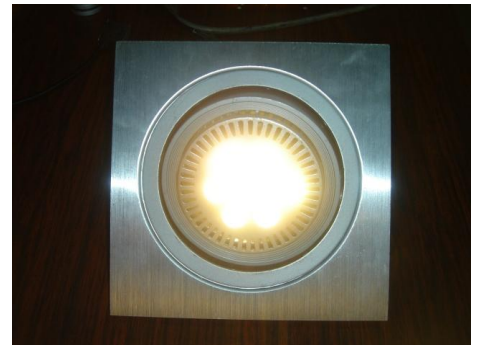
BINAY QR111 module mounted on faceplate (Faceplate supplied by user – not part of unit)