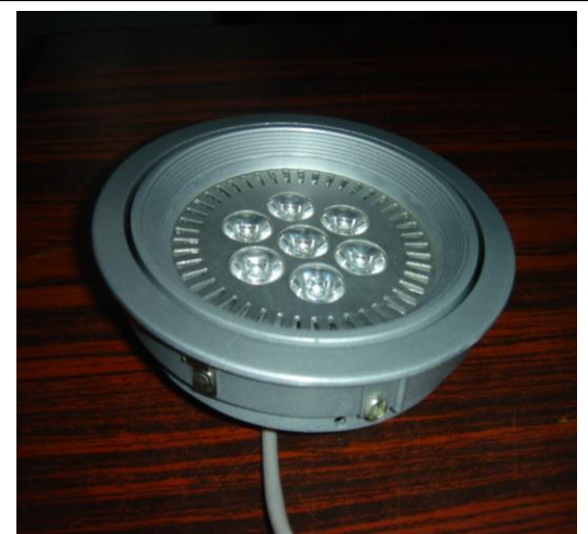
BINAY POWERLED QR111 MODULE